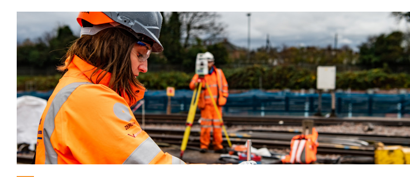
London Underground Track Renewals