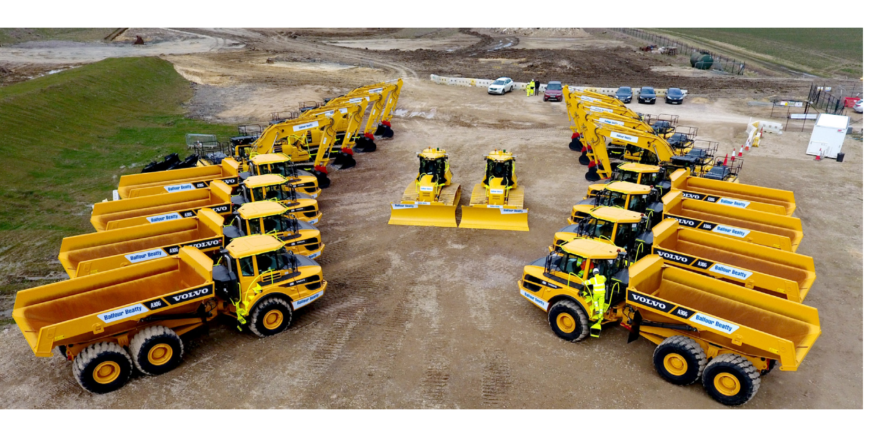
Balfour Beatty machinery

We value and embrace diversity and equality, putting them at the heart of what we do. We are proud that the gender balance of our team is almost equally balanced and that we continue to recognise the benefits of building a balanced and diverse team, addressing all aspects of diversity.