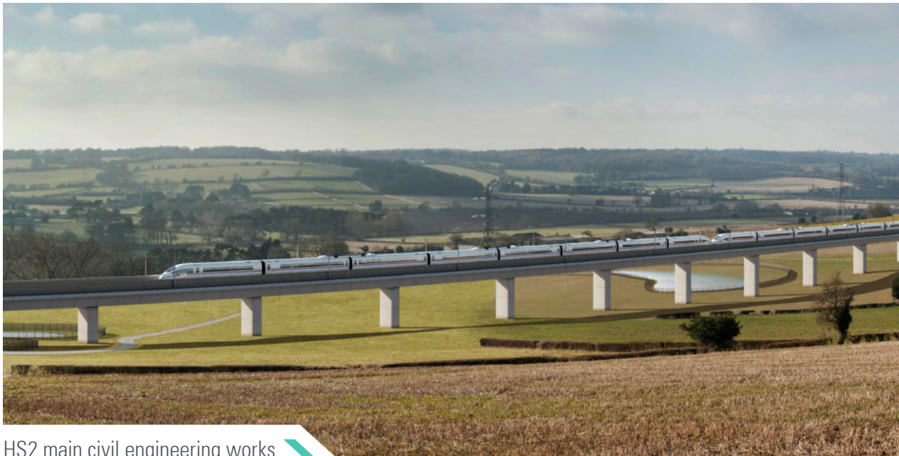
HS2 main civil engineering works

Modern Methods of Construction (MMC) offer a major opportunity to enhance project efficiency and transform the construction and infrastructure industry. Major projects like HS2 are already using prefabricated modular segments, and there is a growing interest in expanding MMC practices to construct hospitals, schools, and housing.