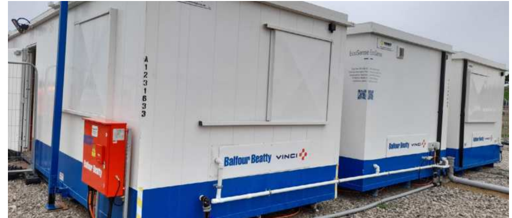
Our EcoSense cabins reduce carbon emissions on-site by up to 30%, and are one of a range of solutions that we're mandated.

Our EcoNet technology works by controlling and reducing the energy output from key appliances in cabins, such as those in kitchens, drying rooms and office spaces. Scan the QR code and watch our video to find out more.