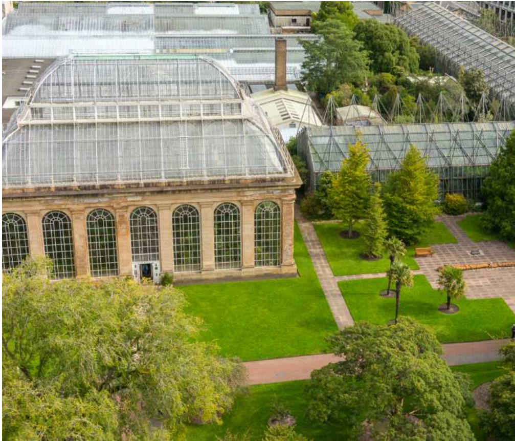
We're exploring lower carbon options and solutions on the Royal Botanic Garden Edinburgh – Biomes Initiative.