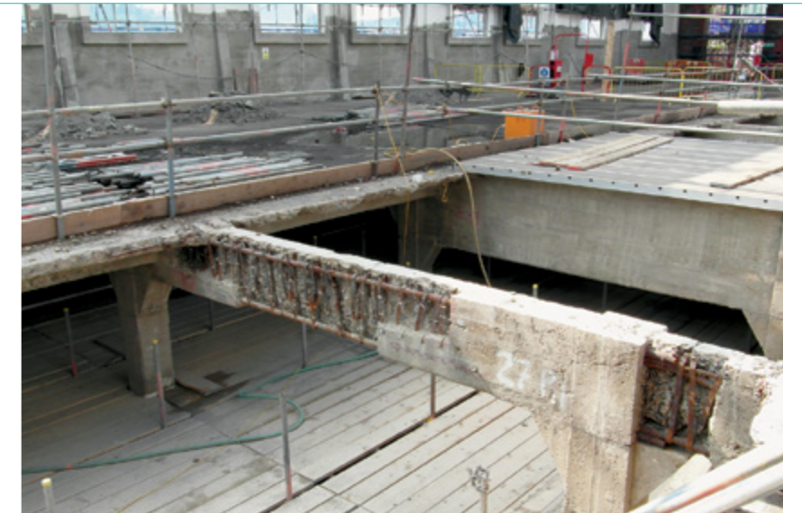
CONCRETE REPAIRS AT NEWCASTLE POLICE STATION