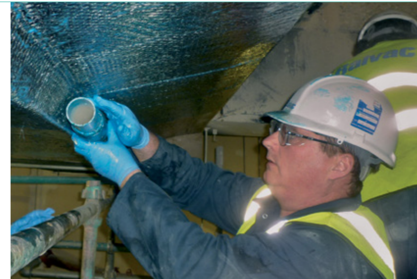
INSTALLATION OF CARBON FIBRE WRAP AT GATWICK AIRPORT