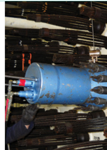
POST TENSIONING TENDON MONITORING

We use a range of specialist techniques to deliver repairs, strengthening, refurbishment and protection of buildings and civil structures.