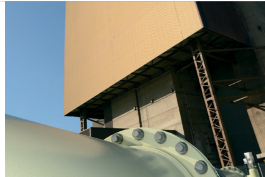
HARTLEPOOL POWER STATION

We have worked across the power sector and have capabilities that range from detailed visual and exploratory investigations of structural defects to the installation of complex steel support systems, concrete repair works and protective coatings.