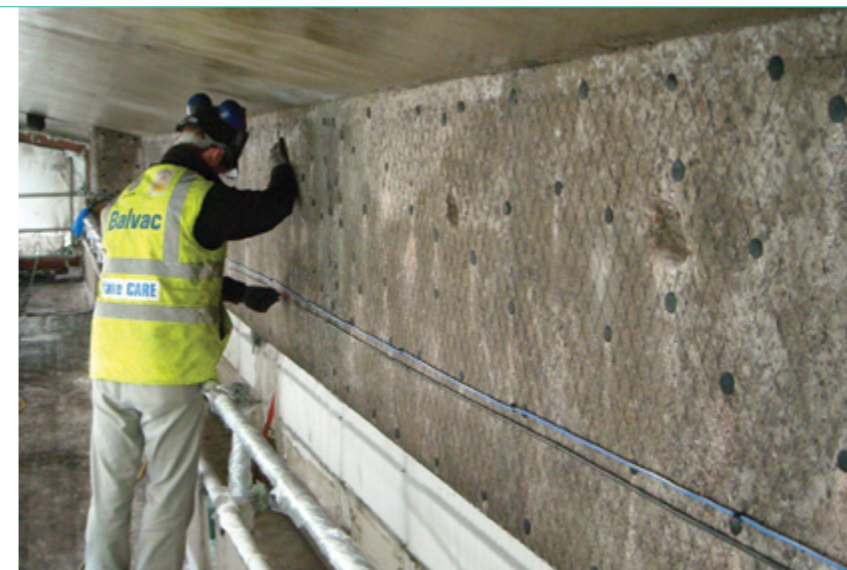
CATHODIC PROTECTION TESTING